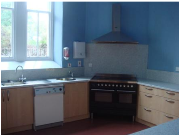
Church Hall Kitchen