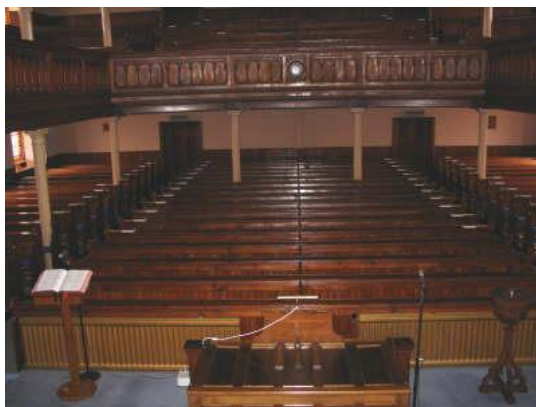
View from pulpit of central pews and gallery