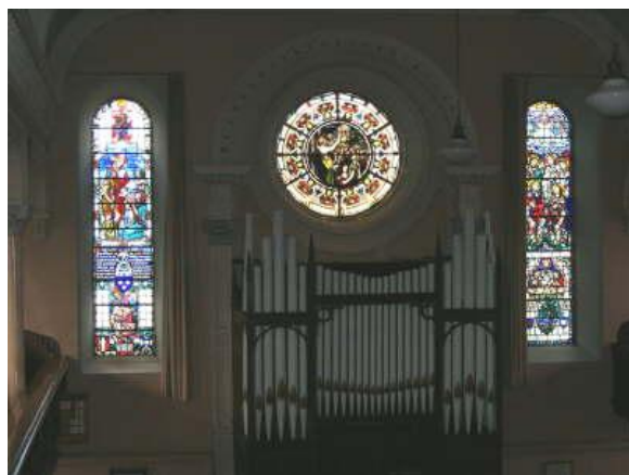
Magnificent stained glass windows and organ pipes behind pulpit.