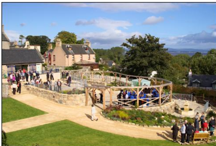
Rose Garden High Street Tain

Raigmore Hospital in Inverness is the main Hospital for the area with the Minister making regular visits.