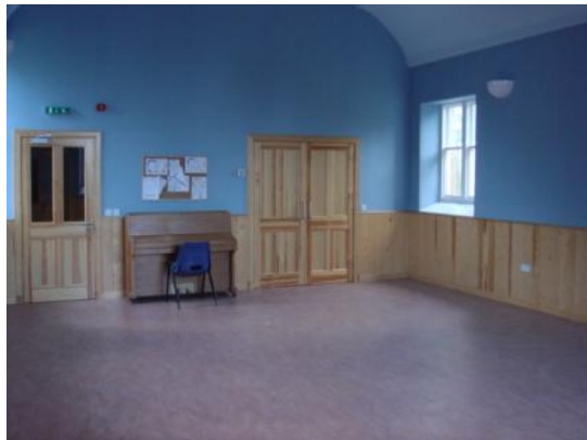
Second Church Hall