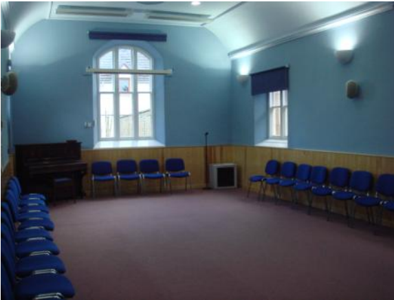
Main Church Hall