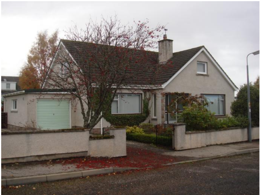
Tain Parish Church Manse

The Manse is a well maintained one and a half-storey detached villa situated at the end of a cul-de-sac in a quiet residential area some 5 minutes walk from the Church. The Manse was built in the late 1960's and has been regularly maintained and upgraded. There is an attached brick garage and a small easily managed front and back garden with one outbuilding at the rear of the property.