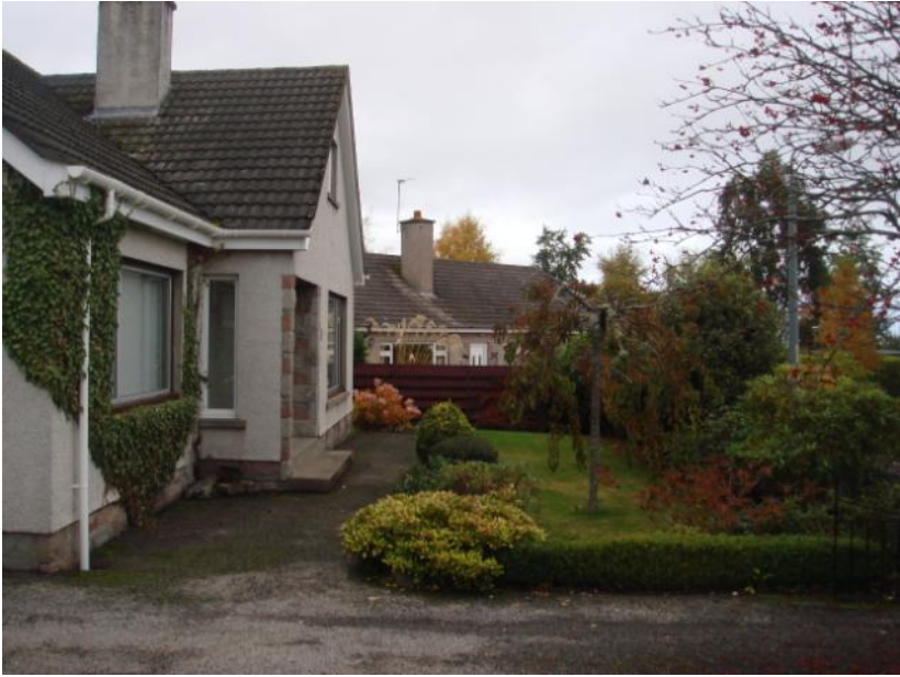
Manse Front Garden

Accommodation on the ground floor consists of one public room, dining room, study room, double bedroom, kitchen and bathroom. The stairway from the large hall leads to the first floor with a shower room, two double bedrooms, one with a small room attached.